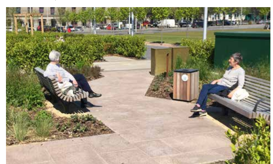
Social seating arrangements