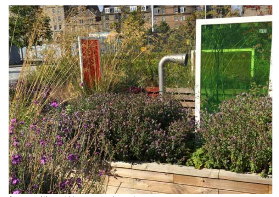
Sound and light within a community garden