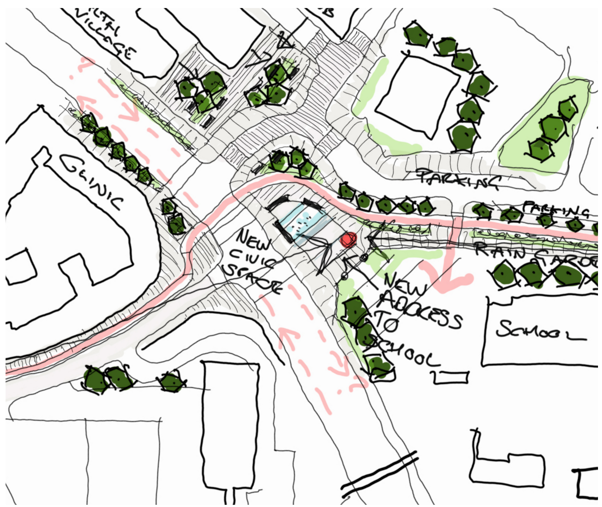
A potential new civic space, bringing the City centre closer to the Beach and by doing so, creating a direct pedestrian and cycle route onto Beach Boulevard. This could be achieved by reducing the land take of existing road infrastructure.

The options illustrated opposite illustrate two different potential reconfigurations of the roundabout for further exploration.