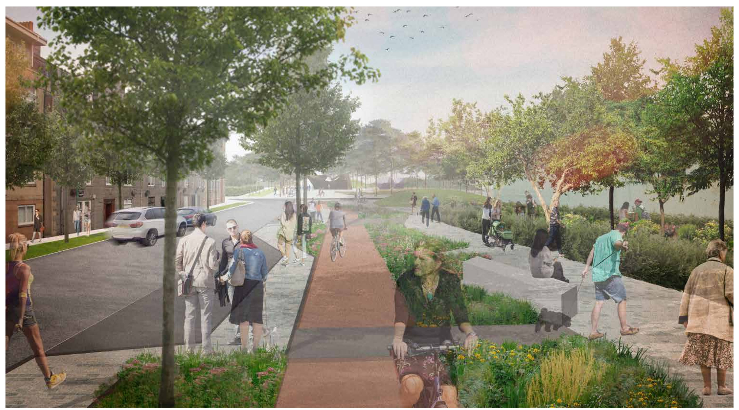
A potential view of Beach Boulevard with a new segregated cycleway and soft landscape.