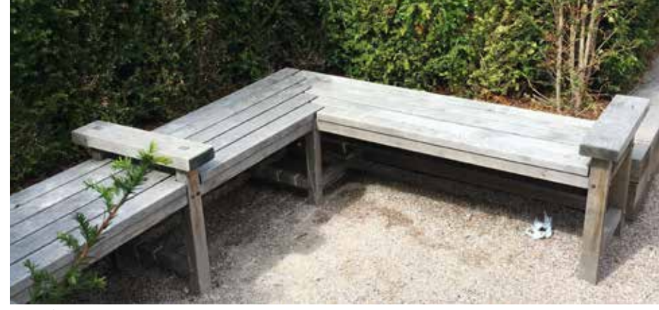
Social seating arrangements