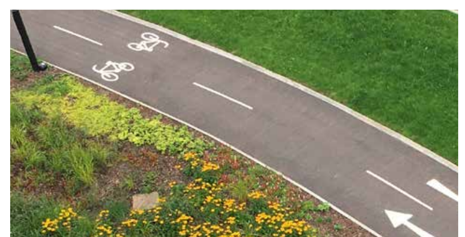
Active travel and new planting replacing existing road infrastructure, Glasgow.