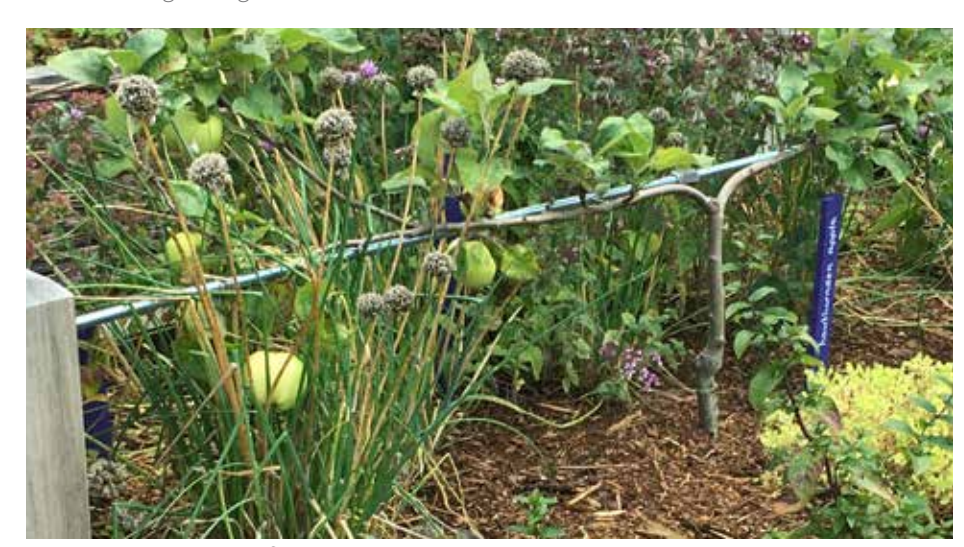
Fruit trees in step over form